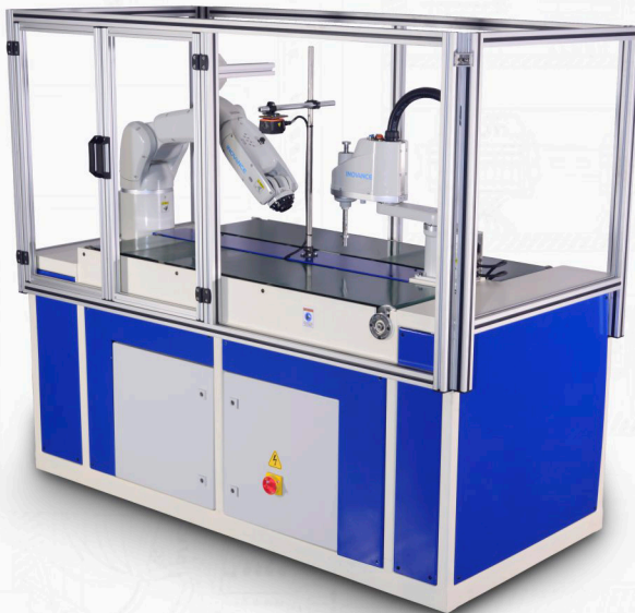
ROBOTICS SYSTEM INTEGRATION